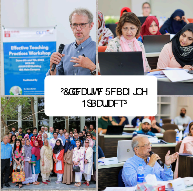
2&GFDMVF 5FBDI JCH 1SDUDFT³

7KH HYHQV FRQFOGCHG ZLWK SUHMHQDMRO/ DGG FHUMFEDM GLVEXMRQ HTXISSIQ SDUWISDQVZ LK VMOVR HQDQFH VMDFKIQJ HIFVMHQW DQG VMGHQVHQJ DJHP HQV