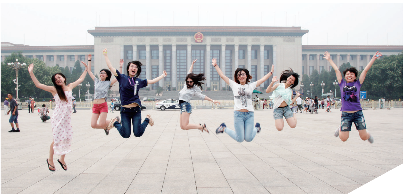
Touring the Tian'anmen Square