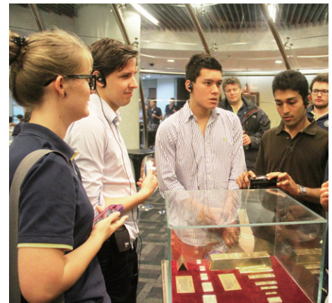
Visiting the Industrial and Commercial Bank of China

Capitalizing on the School's close industry connections, attendees will have the chance to visit major financial institutions to gain first-hand knowledge of Chinese financial markets.