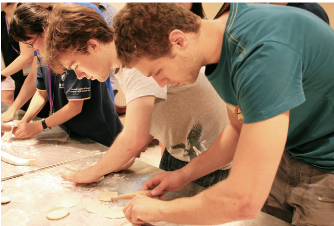
Making Chinese Dumplings