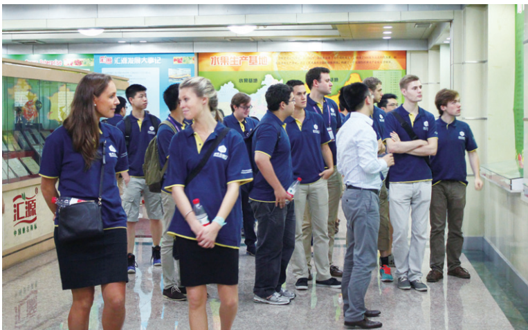
Visiting Huiyuan Group Corporation