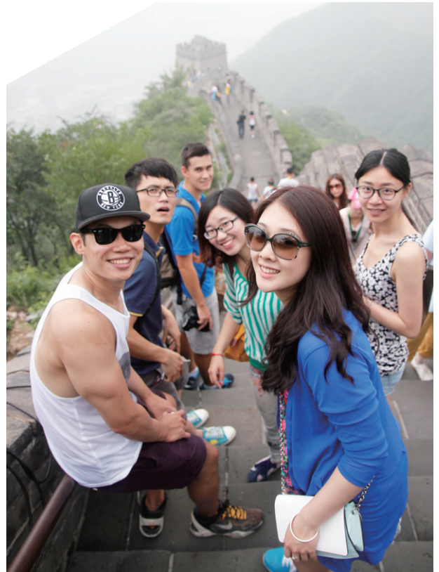
Touring the Great Wall

Additionally, cultural events and tours to popular local attractions will give the attendees a glimpse of the fascinating Chinese culture.