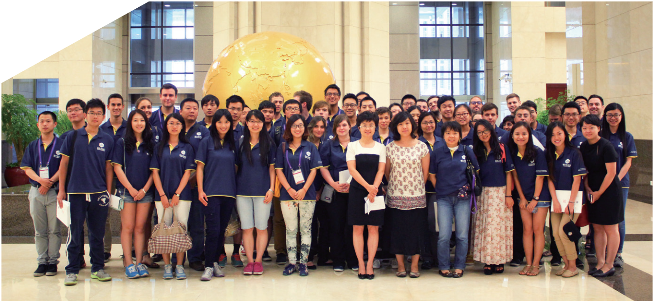
Visiting the Agricultural Bank of China