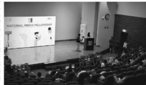
AWARENESS: A speaker expresses her views at the launch of the second National Media Fellowship for gender-based violence and child marriages at IBA-CEJ.

The fellowship is a collaborative effort made by the Centre for Excellence in Journalism at the Institute of Business Administration (CEJ-IBA), the National Commission on the Status