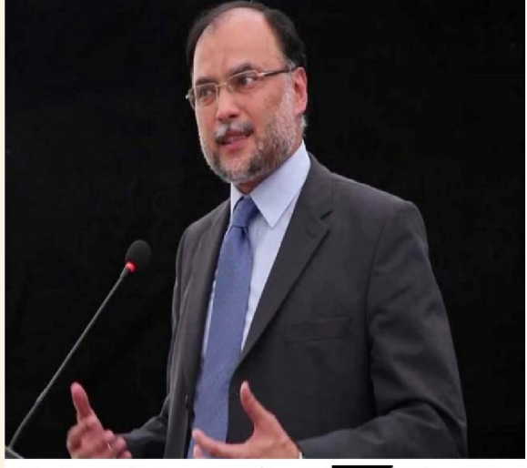
دریں اثنا احسن اقبال ن<mark>ے آئی ہی اے</mark> کے تحت ورلڈ اسلامک فنانس فورم 2024 سے خطاب کرتے ہوئے کہا کہ افلاطون نے سوچا تھا کہ یہ ملک نہیں چل سکے گا، تاثر پھیلایا گیا کہ ملک ڈیفالٹ كرجائے گاليكن پاكستان سرى لنكا نہيں ہے بلكہ ايك ايئمي طاقت كا حامل ملك ہے، ہم نے کراچی یورٹ کو ایک بڑا معاشی حب بنادیا ہے، پالیسیوں کو 10سال کیلیے منجمد کریں گے۔