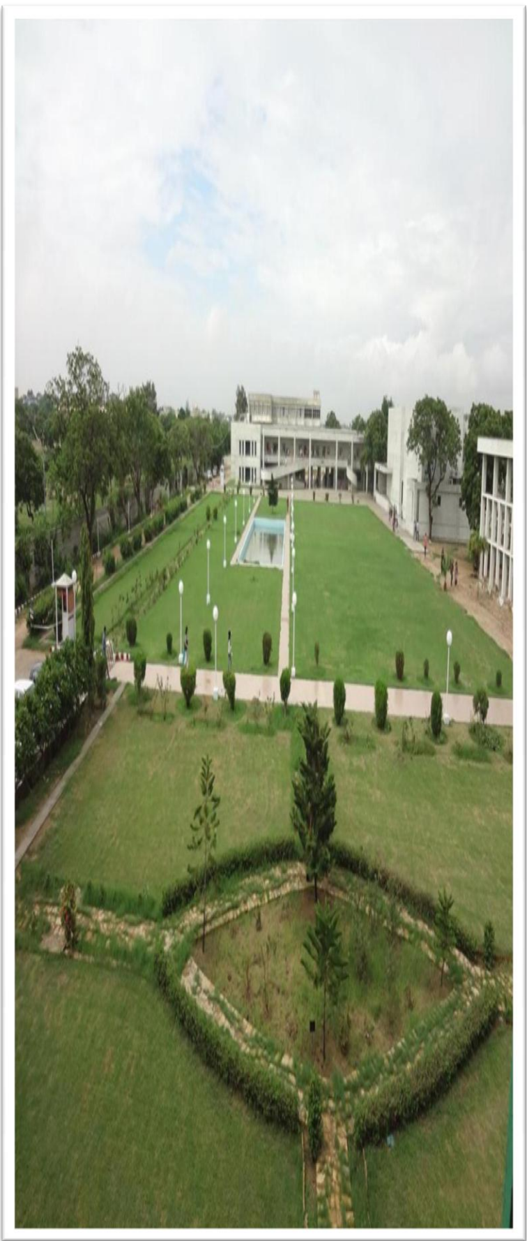
MAIN CAMPUS LAWN