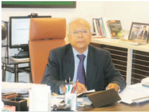
Dean & Director, Dr. Ishrat Husain

The expansion in the physical and Information Communications & Technology infrastructure of IBA achieved during the last four years has now enabled us to diversify our program offerings in other areas besides consolidating the existing programs. As of now, we have completely revamped MBA and terminal BBA programs in place and the initial pangs of birth have been overcome.