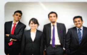
Self Development Program