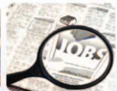
Excellent Employment Opportunities