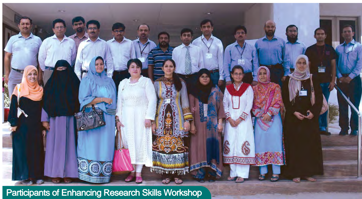
Participants of Enhancing Research Skills Workshop

“ Quality is not an act, it is a habit. ”