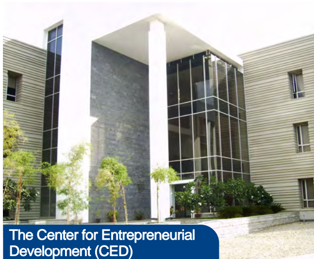
The Center for Entrepreneurial Development (CED)

The entrance has landscaped areas and a water body to provide softness to the façade. Also, there is a controlled entry point for security reasons. The special features of this building include energy efficient cavity walls which provide insulation and reduce heat loss in summer. Also, the flooring has durable porcelain tiles of high-density which are resistant to scratches, cracking or chipping. They are capable of withstanding extreme heat, cold, water, dust and dirt.