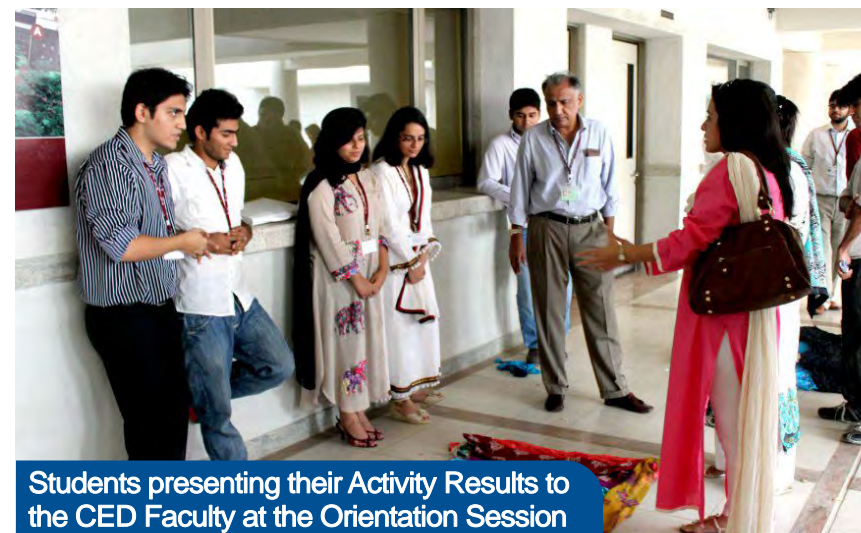
Students presenting their Activity Results to the CED Faculty at the Orientation Session

The program was followed by an Iftar cum dinner where the freshmen interacted with senior BBA Entrepreneurship students and Faculty members. It helped to break the ice and make the newcomers feel at ease so that they could begin their journey with confidence and enthusiasm.