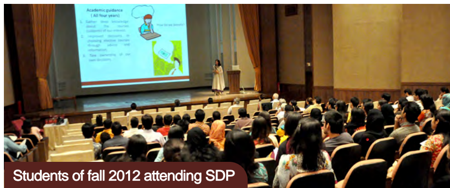
Students of fall 2012 attending SDP

In the era of personalized education, IBA's Student Development Program is an important component. The concept behind this newfound approach is to make IBA students work on their professional and developmental skills throughout their stay at IBA. To do so, faculty members, in partnership with IBA Alumni, work together to coach and mentor Freshmen to help them reach their career goals.