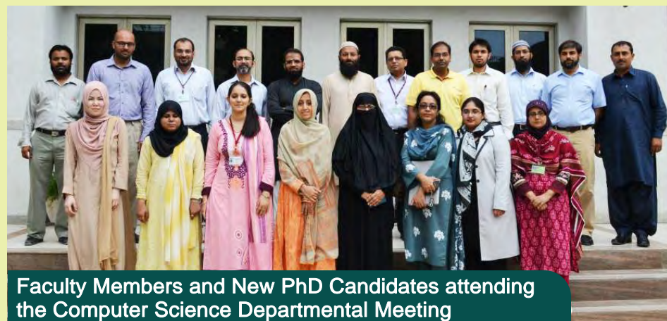
Faculty Members and New PhD Candidates attending the Computer Science Departmental Meeting

A departmental meeting and orientation session for the new PhD candidates was hosted by the Faculty of Computer Science on August 31, 2012. This provided an excellent opportunity for the new candidates to interact with the present faculty.